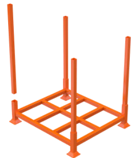
ONE POST REMOVED