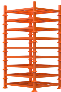
STACKED 9 HIGH FOR SHIPMENT TRUCK SHIPMENT