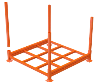
ONE POST REMOVED