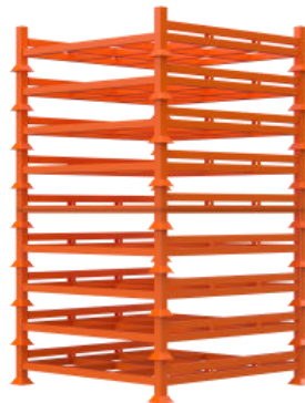
STACKED 9 HIGH FOR TRUCK SHIPMENT