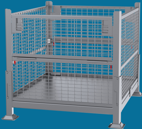
Standard Zinc Plated Finish