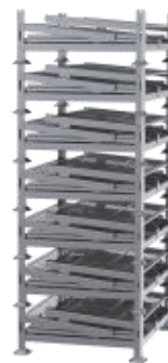
STACKED 7 HIGH FOR TRUCK SHIPMENT