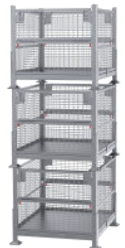
STACKED 3 HIGH FOR TRUCK SHIPMENT