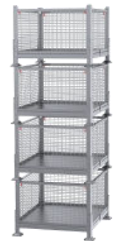
STACKED 4 HIGH FOR TRUCK SHIPMENT