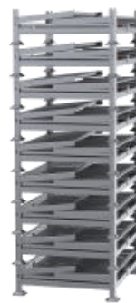
STACKED 9 HIGH FOR TRUCK SHIPMENT