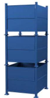
STACKED 3 HIGH FOR TRUCK SHIPMENT