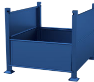
2 GATES OPEN