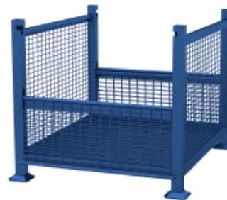
2 GATES OPEN