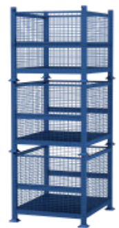
STACKED 3 HIGH FOR TRUCK SHIPMENT