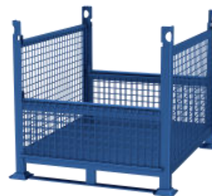
2 GATES OPEN