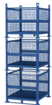
STACKED 3 HIGH FOR TRUCK SHIPMENT